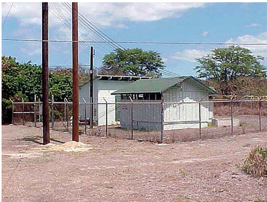
Feature D (Pump House complex), showing two of three buildings. Author