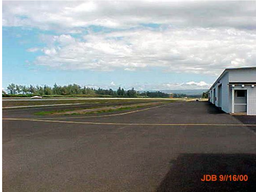
Dillingham Airfield Runway 8/26 looking east. Author