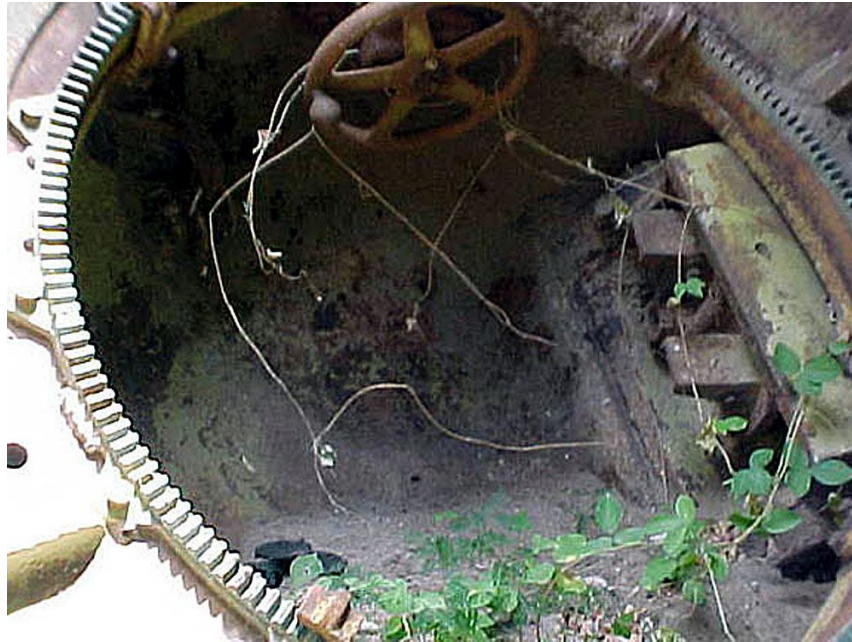
Interior of Feature G depicting hand crank wheel that moved the cupola. Author