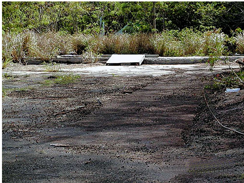
Feature F. Foundations at site of former control tower.