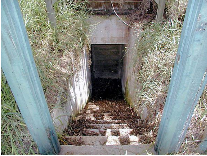
Descending stairway of Feature A. Author