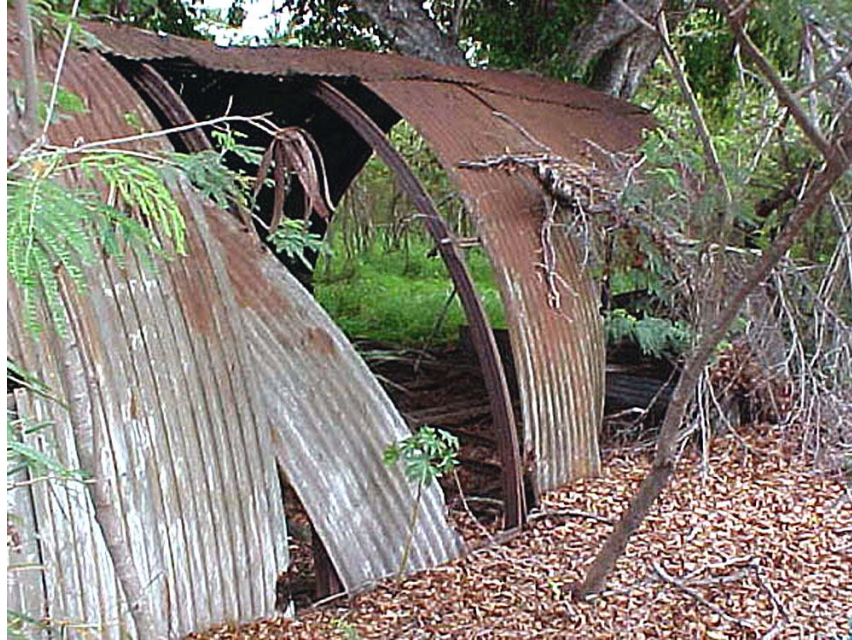
Same feature as above, view towards the southeast. Author