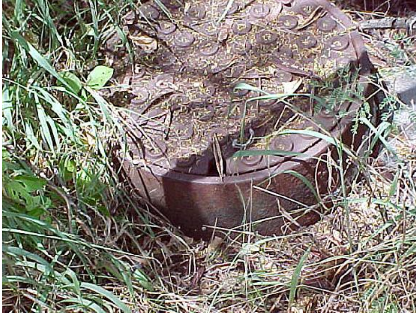
Manhole cover situated some 75 feet east of Feature A. Author