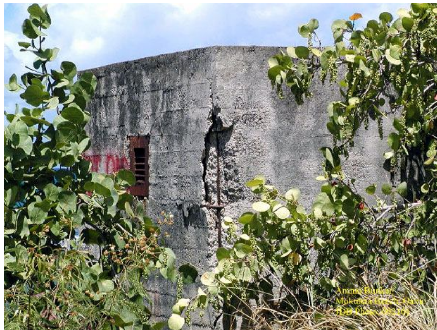
Feature 1A. Back or west wall on the left showing louvered vent and spalling to the corner. Author