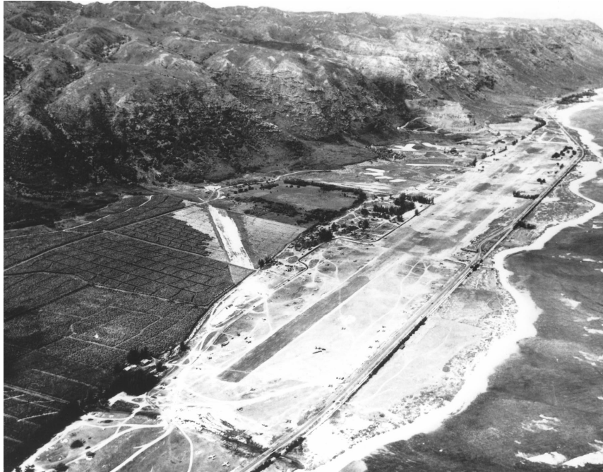
Early World War II photograph of Mokuleia showing uncompleted main Runways 8/26 and 4/22 running at an angle towards the mountain c. Aug. 1942.