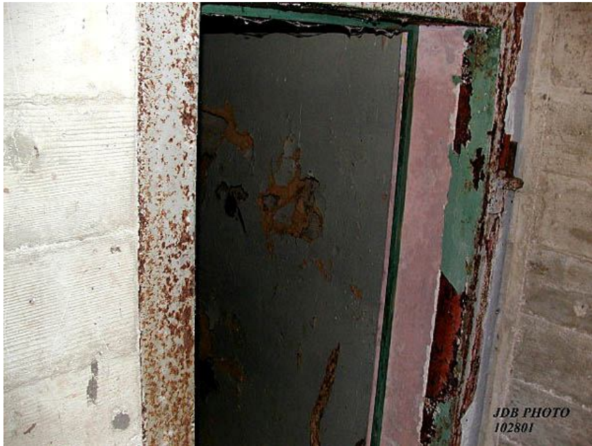
Feature A, showing doorway at bottom of stairway. Author