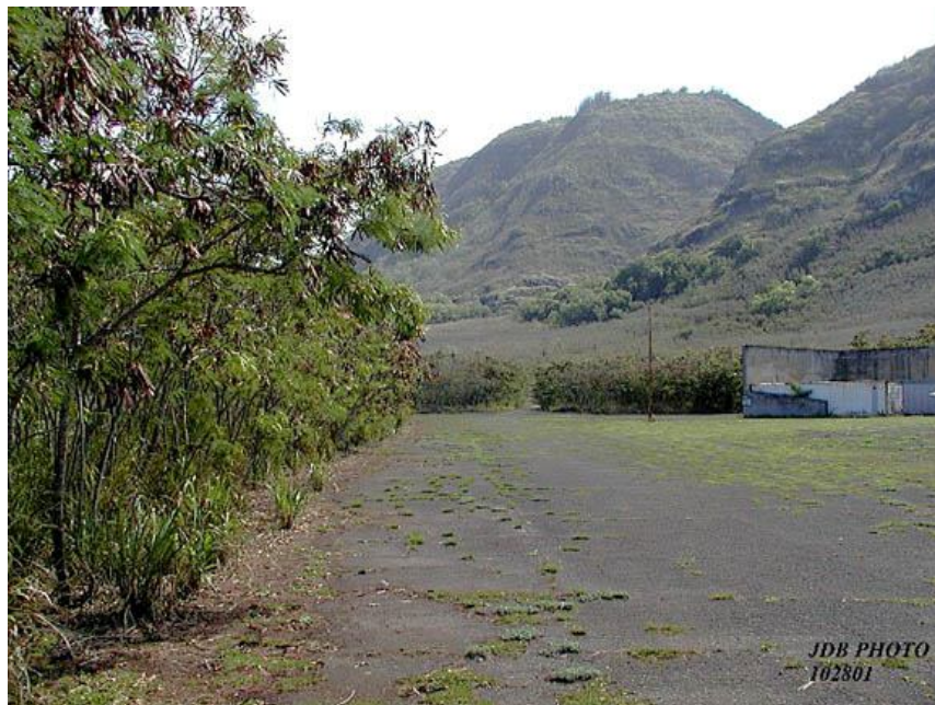
Route to Kealia Trail. Feature C at top right. Author