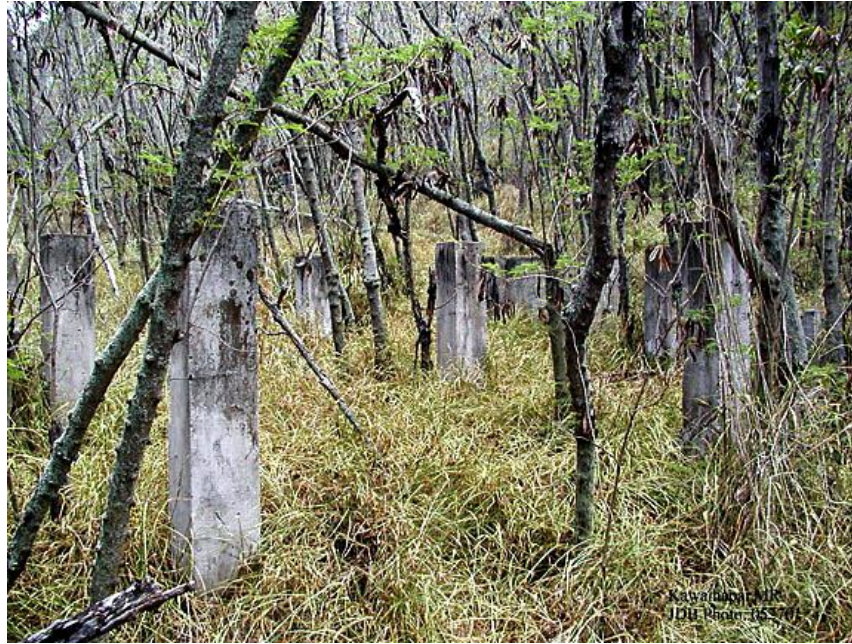
Vertical concrete posts located on east side of gravel road below Feature A. Author