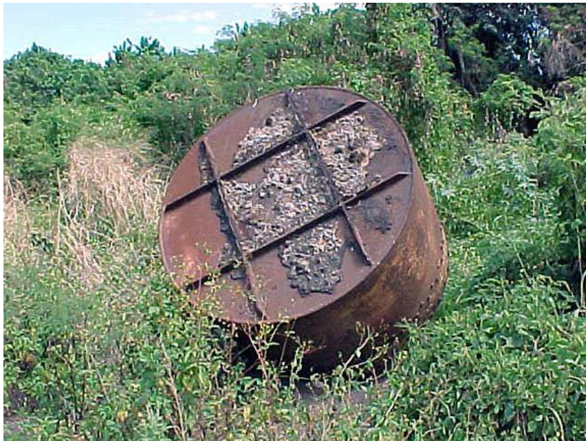
Underside of Feature G.