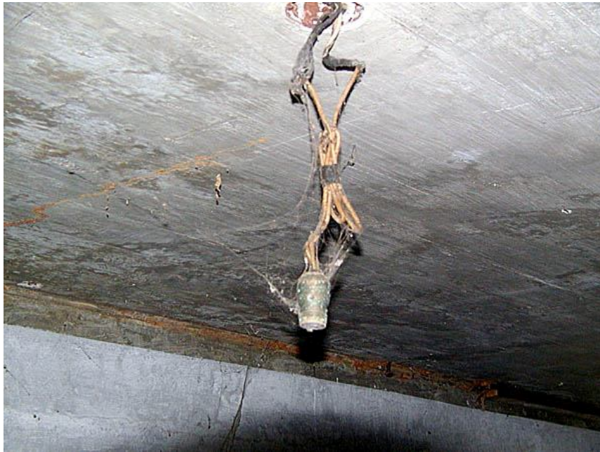
Close up view of light fixture attached to the ceiling inside Feature A.