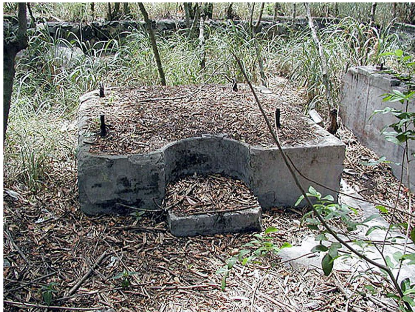
West end of Feature D-1 showing raised platform recorded as Feature D-1e, thought to have mounted an engine. Author