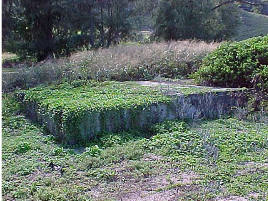
Feature 4A, raised concrete platform at the left rear of Feature 3A. Author