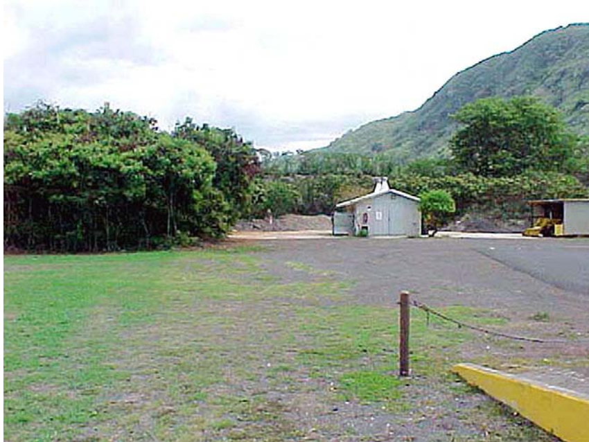
Earth revetment (Feature C-2). Author