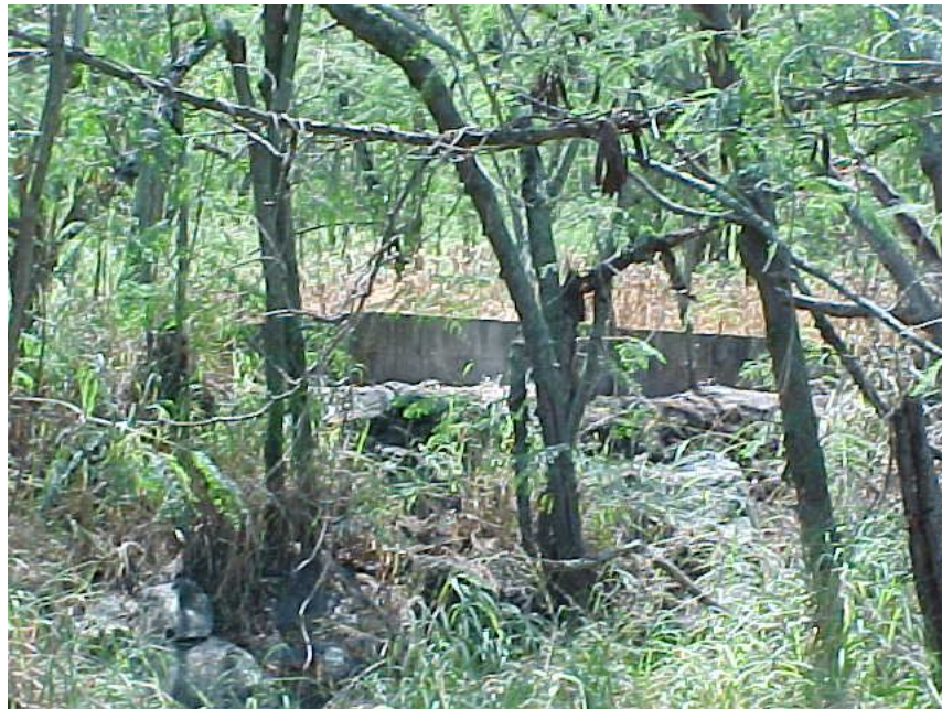
Concrete foundation located southeast of Feature A.