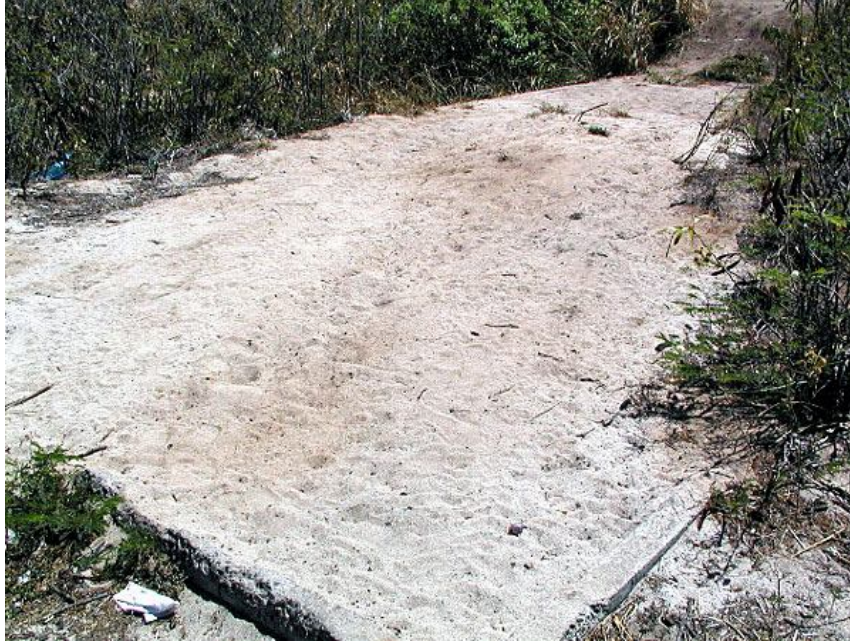
Concrete foundation (not categorized) several yards southeast of Feature 1A.