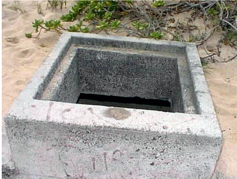
Feature 3A. Close view of front manhole that housed a pipe valve. Author