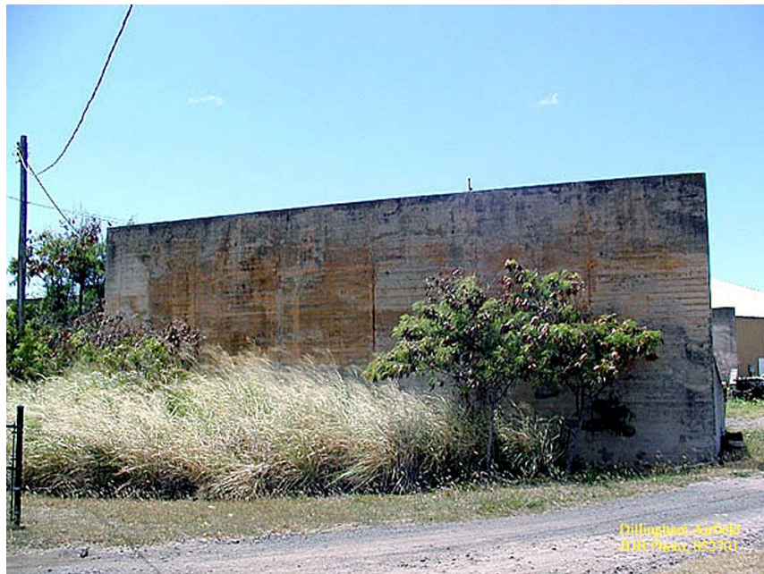
North wall of Feature C-1. Author