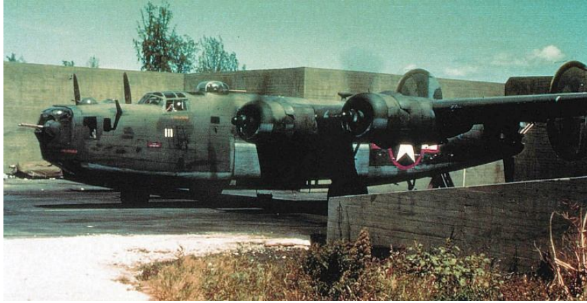
B-24 Liberator bomber at Mokuleia Airfield during WWII.