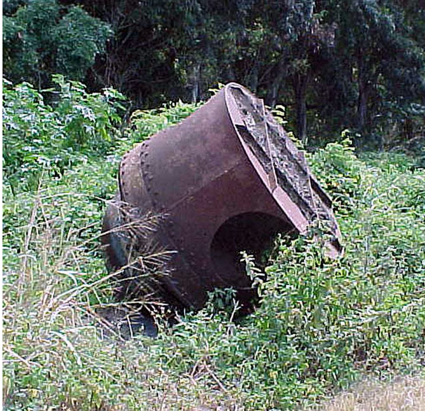
Metal turreted pillbox (Feature G) at Dillingham M.R.