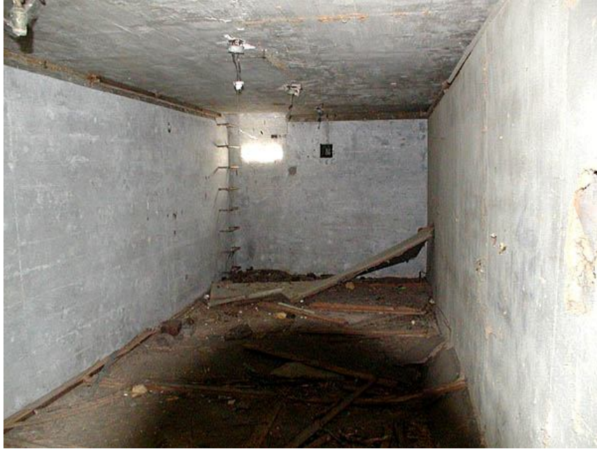
Interior of Feature A looking east, metal rung ladder at upper left. Author