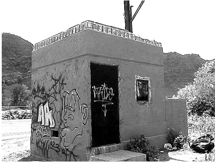
Reverse side of Feature G showing steel door and window opening to the right. Author