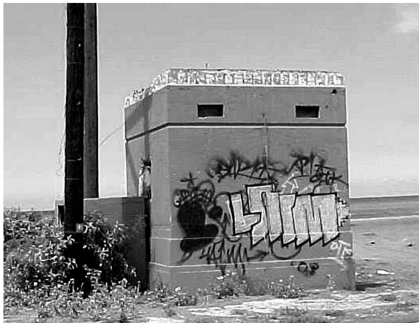
Feature H (Cable Hut S-1) across Dillingham Airfield at the former Mokuleia Army Beach.