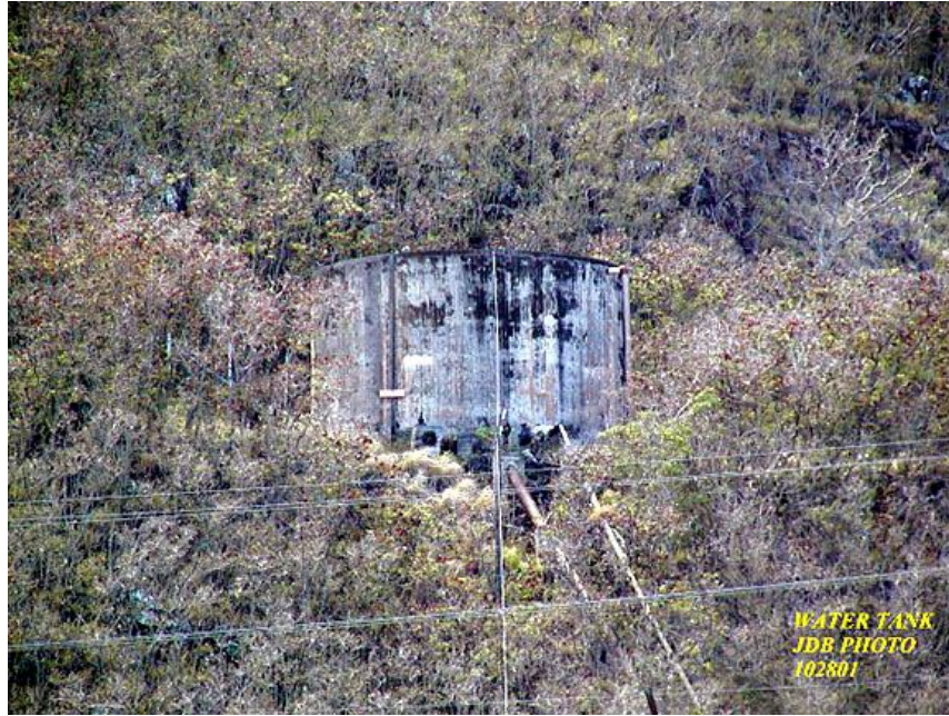
Feature B. 100,000 gallon water tank.