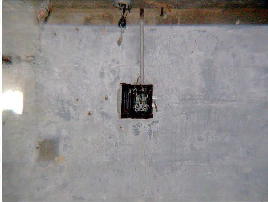
View of east wall of Feature A showing electrical breaker box. Author