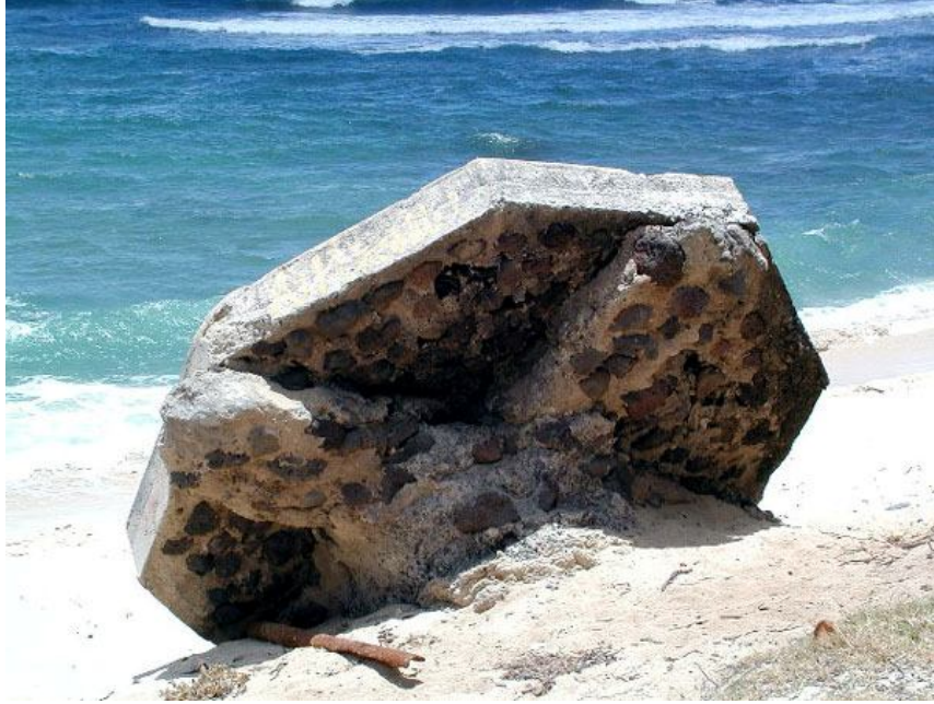
Underside of Feature 2A depicting medium-sized rocks used in its construction. Author