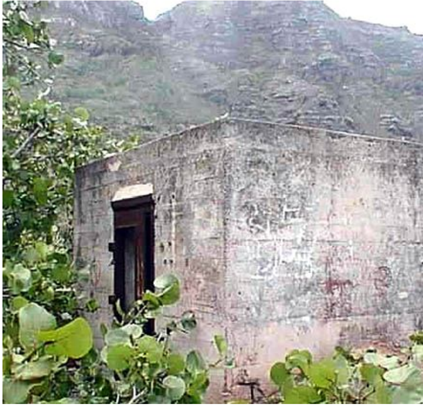
Photo depicts the doorway at the east side of Feature 1A. Author