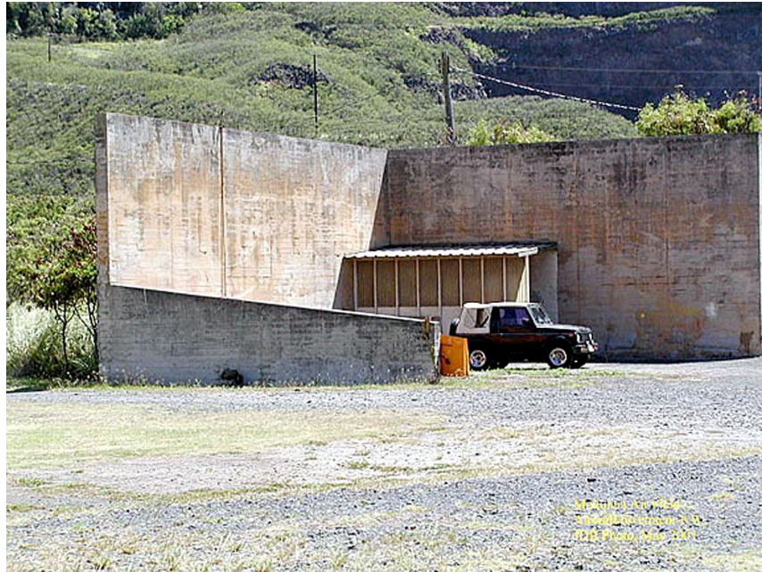
Closer view of Feature C showing height of wall compared to small vehicle.