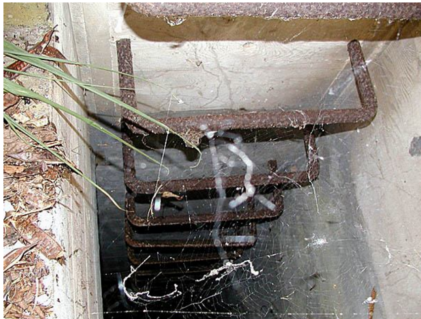
View looking down the shaft of the escape housing. Author