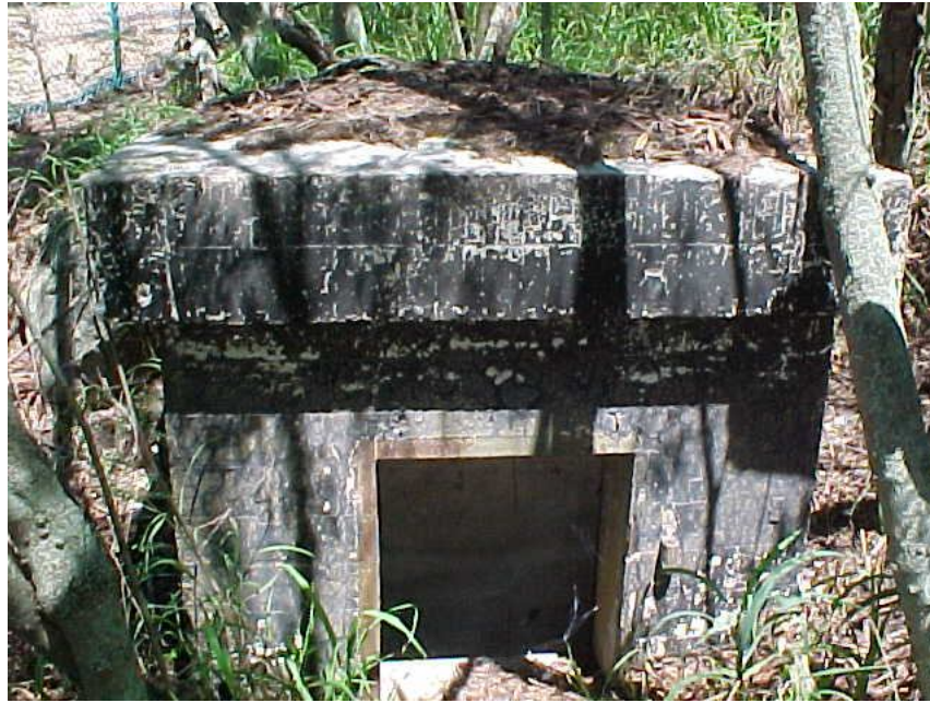
West wall of housing pictured above showing small doorway on the west side. Author