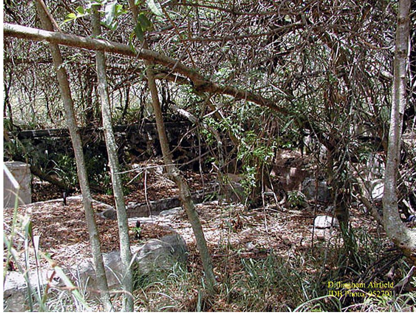
Feature D-1, looking towards northeast. Author