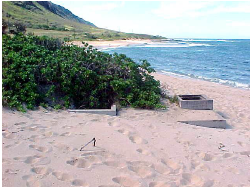
Feature 3A, thought to be sewer pump ejector housing. Note both manholes. Author