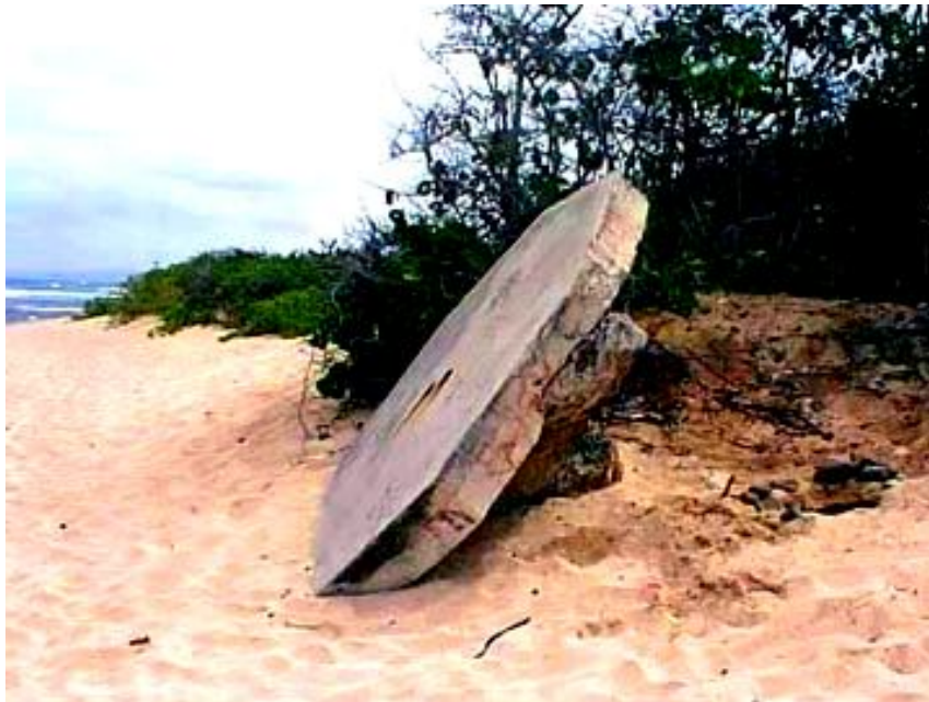
Feature 2A, ten-sided concrete platform thought to be the base of a light machine gun. Author