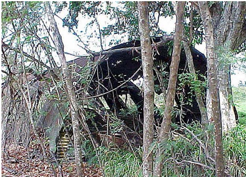
Feature E, rusted hulk of a Quonset hut, view towards the northeast. Author