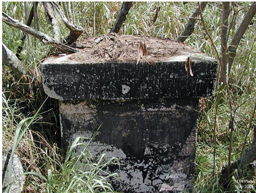
Escape hatch housing of Feature A depicting North wall. Author