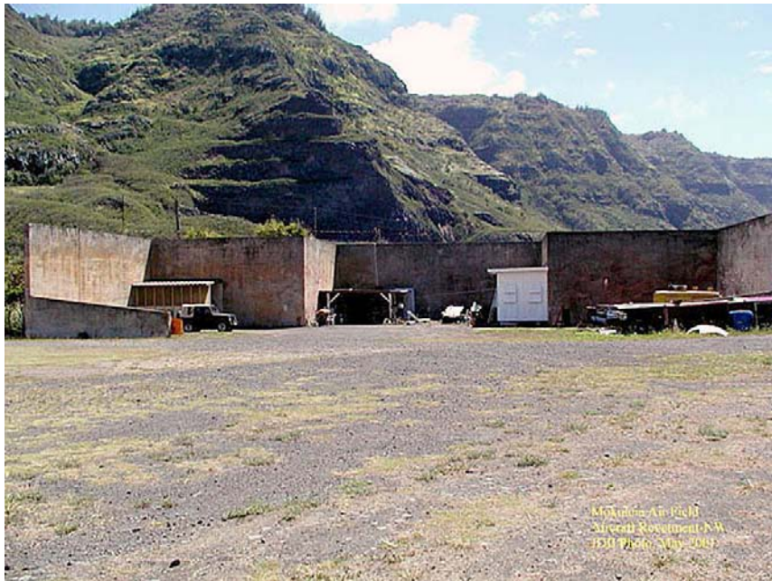
Feature C, aircraft revetment. Author