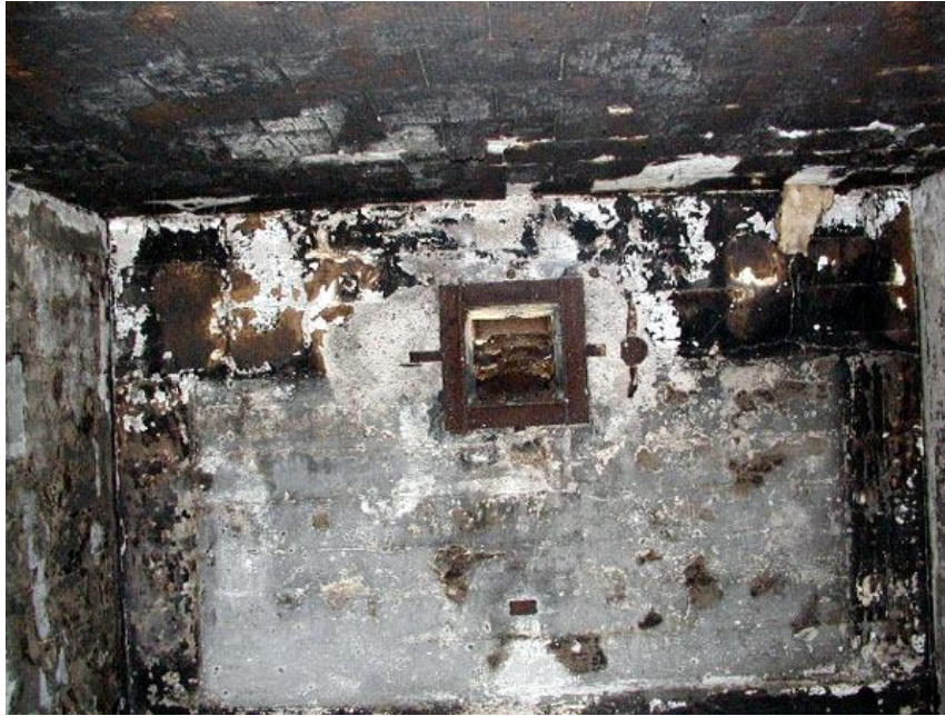
Interior of Feature 1A showing effects of a malicious fire set by vandals. Author