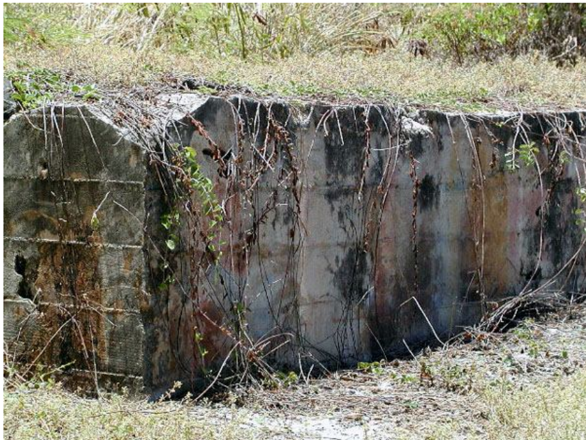
Northeast corner of Feature 4A depicting detail and original wartime camouflage.