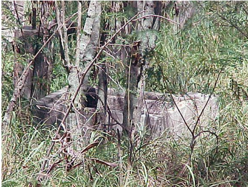
Concrete housing for gate valve thought to be part of the water distribution system, located on the east side of gravel road from Feature A. Author