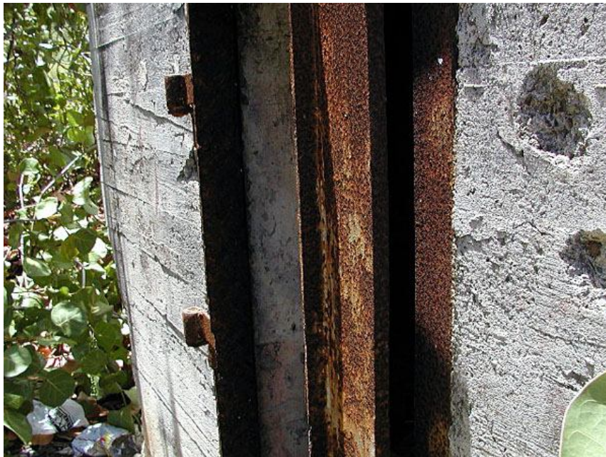
Photo depicts detail of barrel hinges to entrance door of Feature 1A. Author