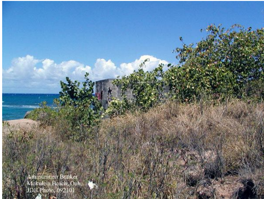
Feature 1A (Ammunition Bunker) as viewed from Farrington Highway.