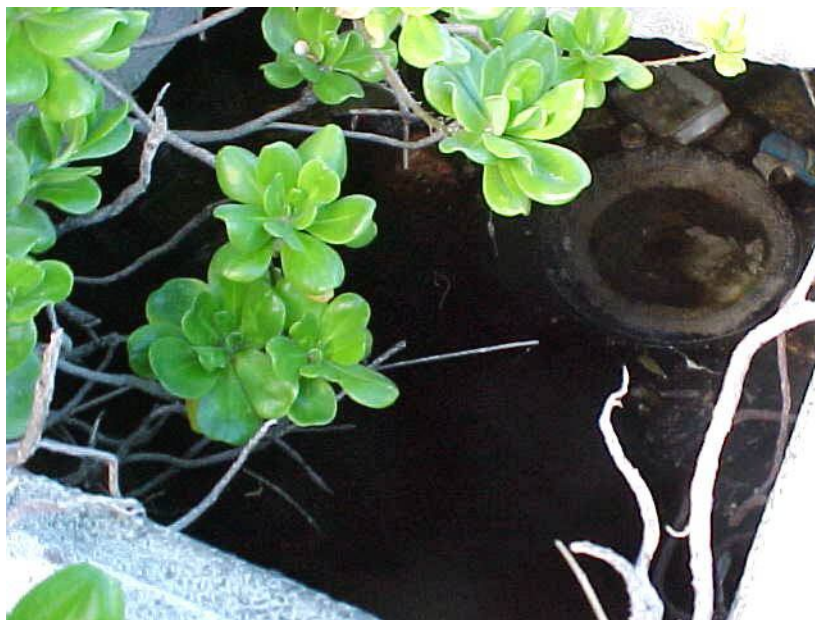
Feature 3A. View of interior of rear manhole depicting flooding by seawater. Author