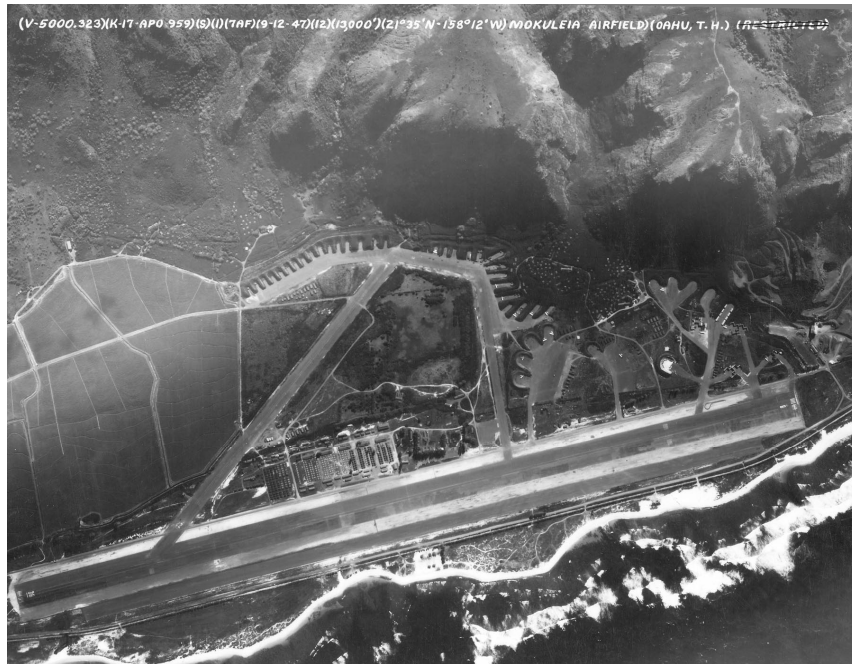
Dillingham A.F.B. Dec. 1947.