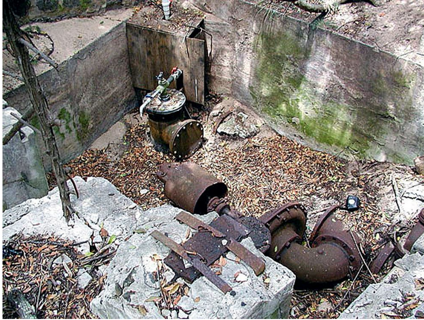
Northeast corner of Feature D-1 showing from left to right, D-1a, -1b, -1c, and -1d. Author