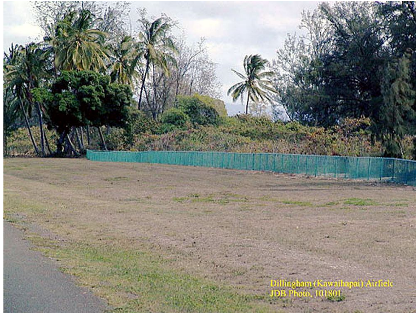
Feature G. Site of old control tower. Author